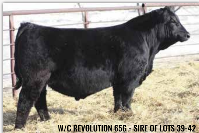
W/C REVOLUTION 65G - SIRE OF LOTS 39-42