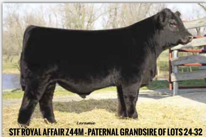
STF ROYAL AFFAIR Z44M - PATERNAL GRANDSIRE OF LOTS 24-32