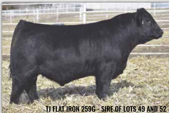
TJ FLAT IRON 259G - SIRE OF LOTS 49 AND 52

Cool made calving ease bull here. Mother is a moderate framed, easy fleshing cow. This guy should be an excellent choice for heifers. Act BW: 83 Act WW: 662