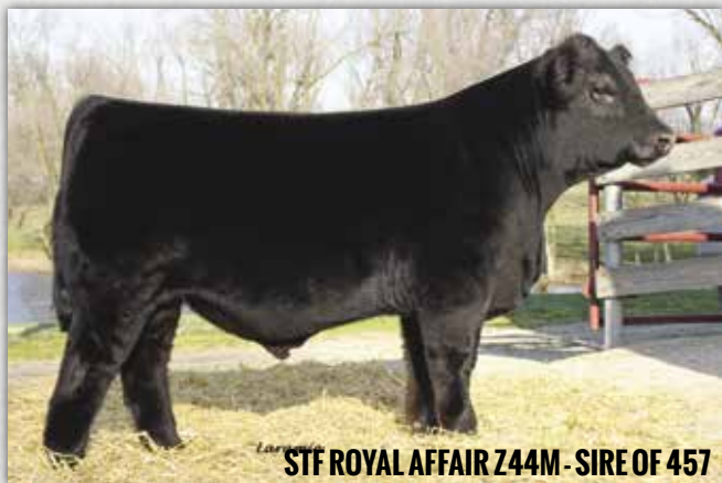
STF ROYAL AFFAIR Z44M - SIRE OF 457

A full brother to 905 with a little more weaning weight. We used GW Premium Beef to add length and frame while maintaining calving ease.